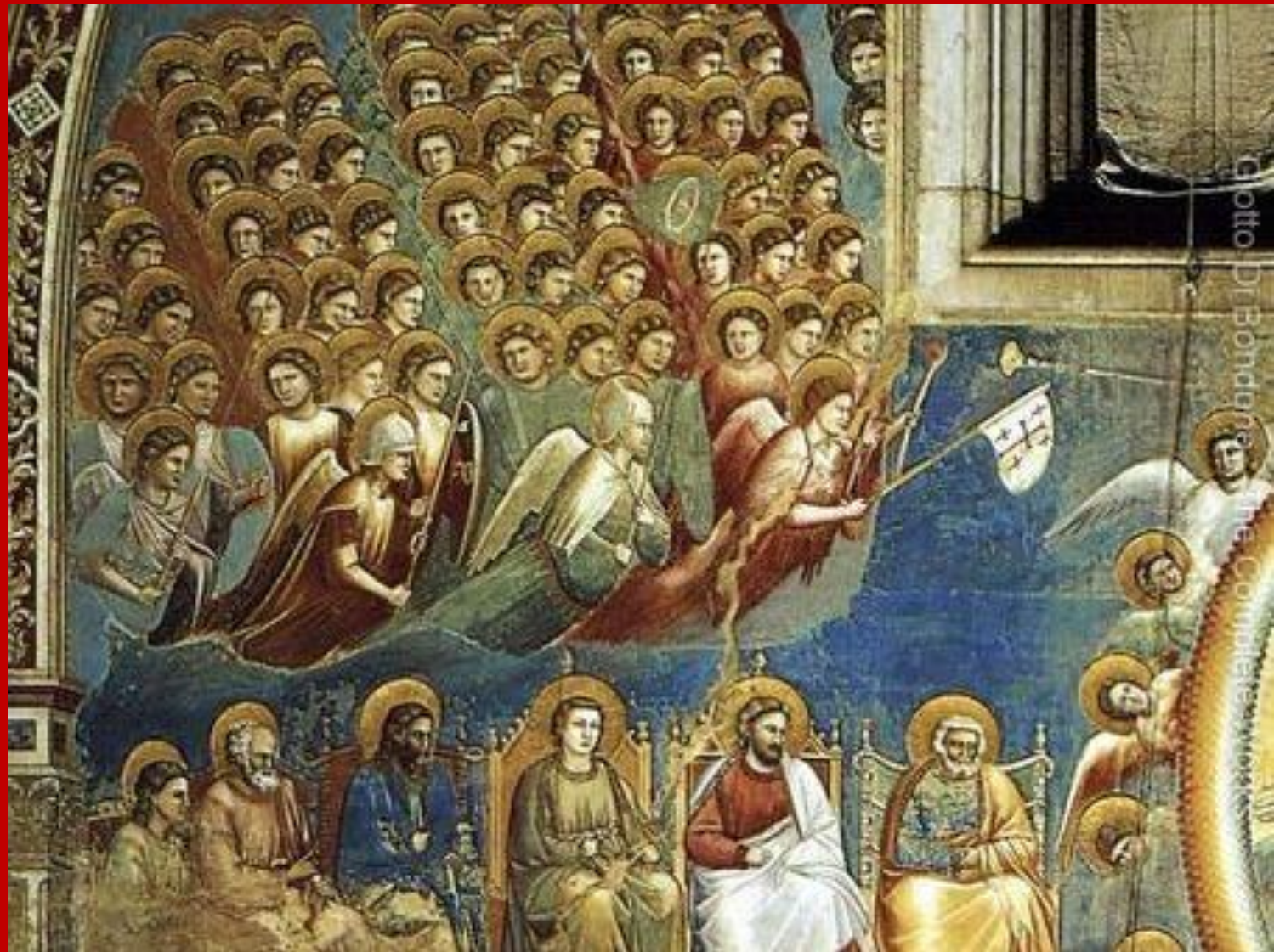
Last Judgment (detail 2) 1306, Fresco, Cappella Scrovegni (Arena Chapel), Padua