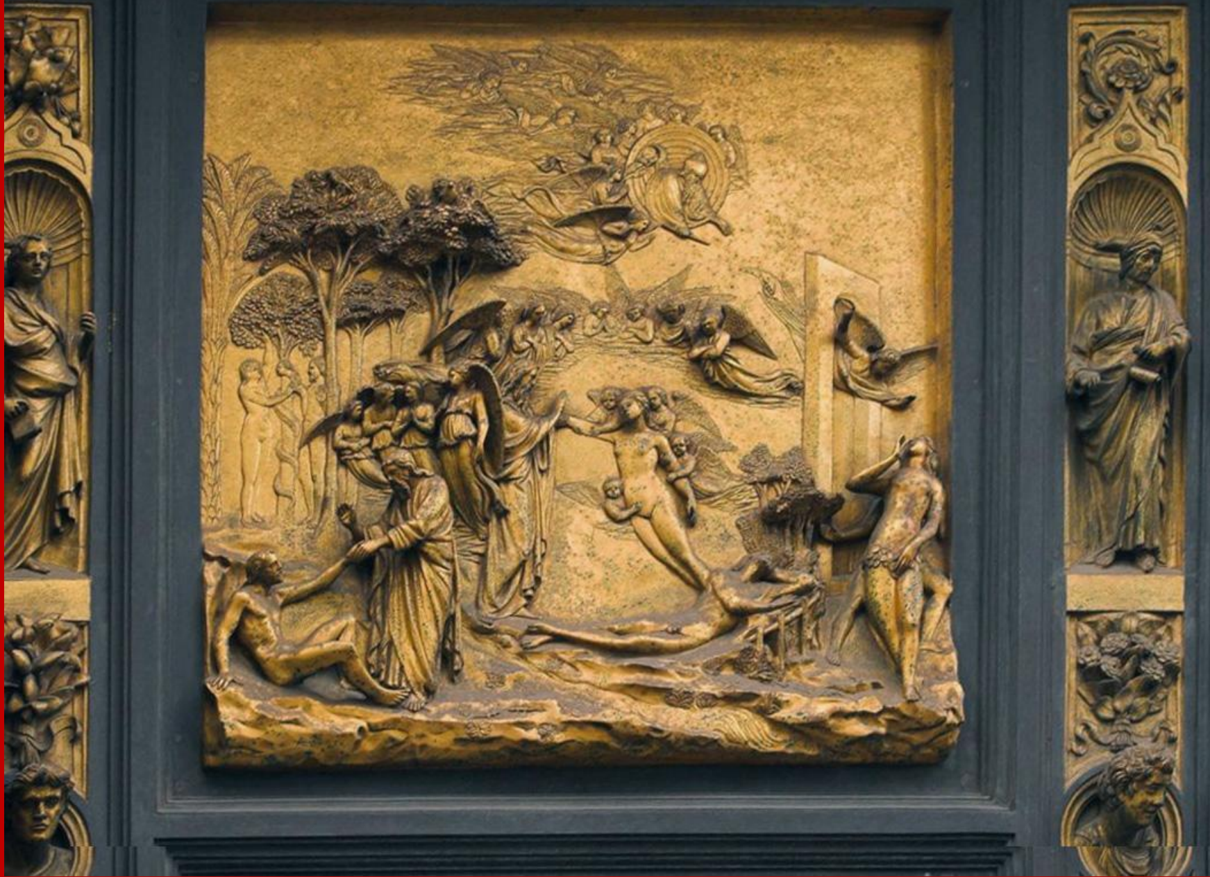
Adam and Eve