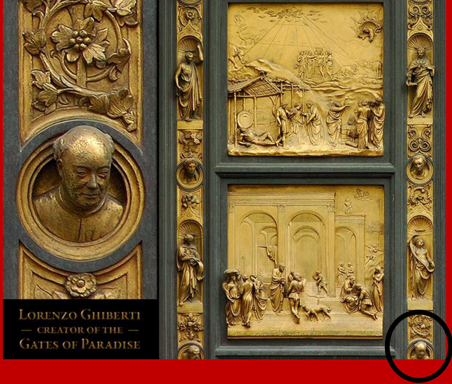
LORENZO Ghiberti — CREATOR OF THE — GATES OF PARADISE

Ghiberti included his own image on the doors