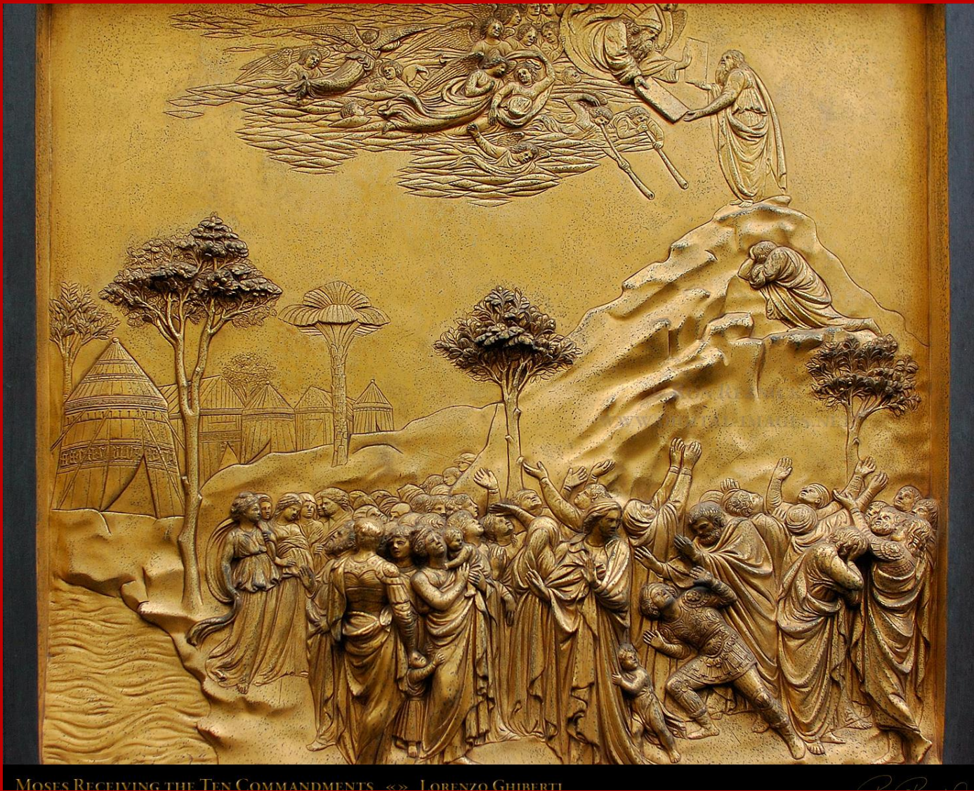
MOSES RECEIVING THE TEN COMMANDMENTS «» LORENZO Ghiberti