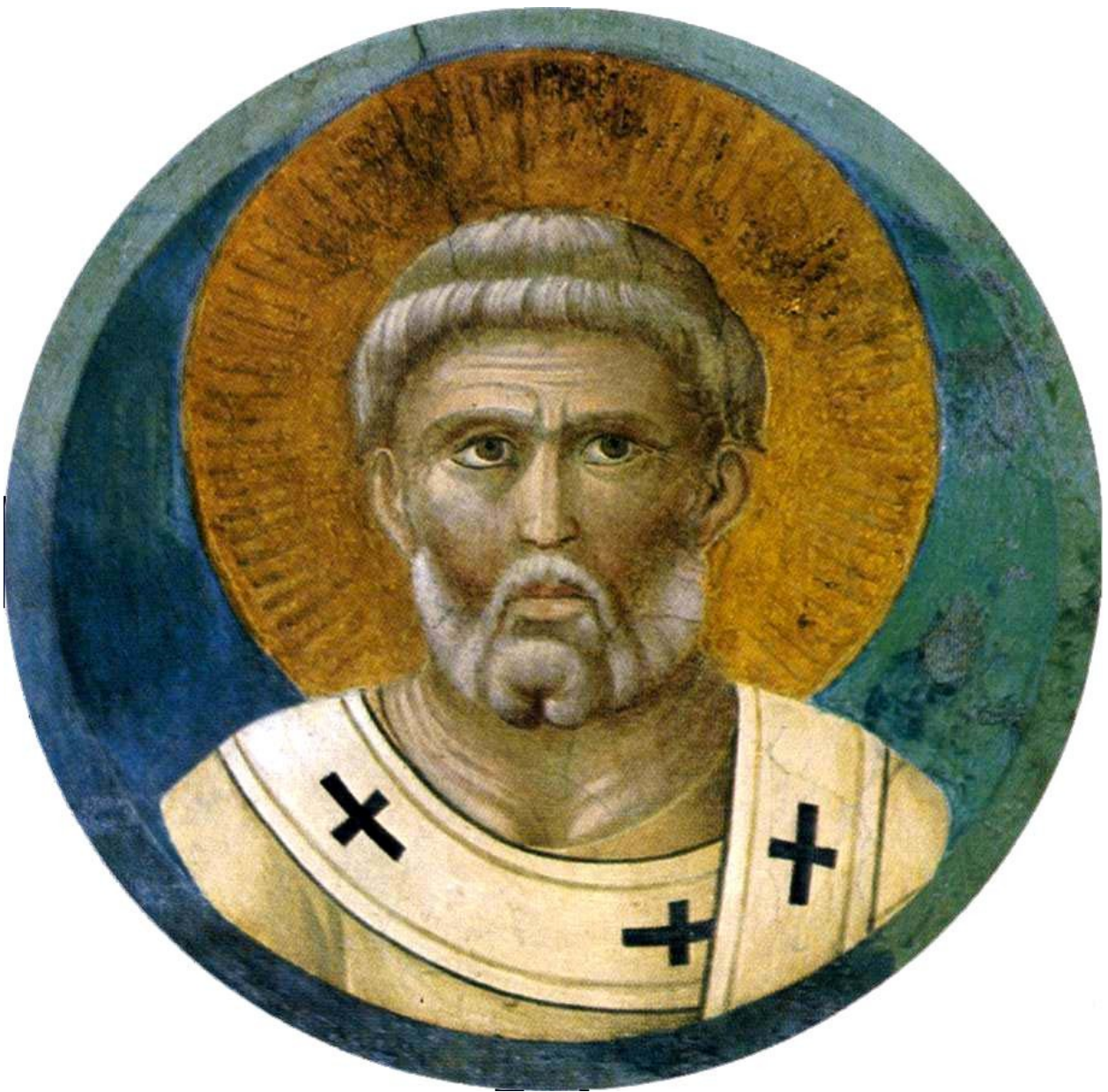
St. Paul 1290s By Giotto Di Bondone

http://www.giottodibondone.org/St-Paul-1290s.html